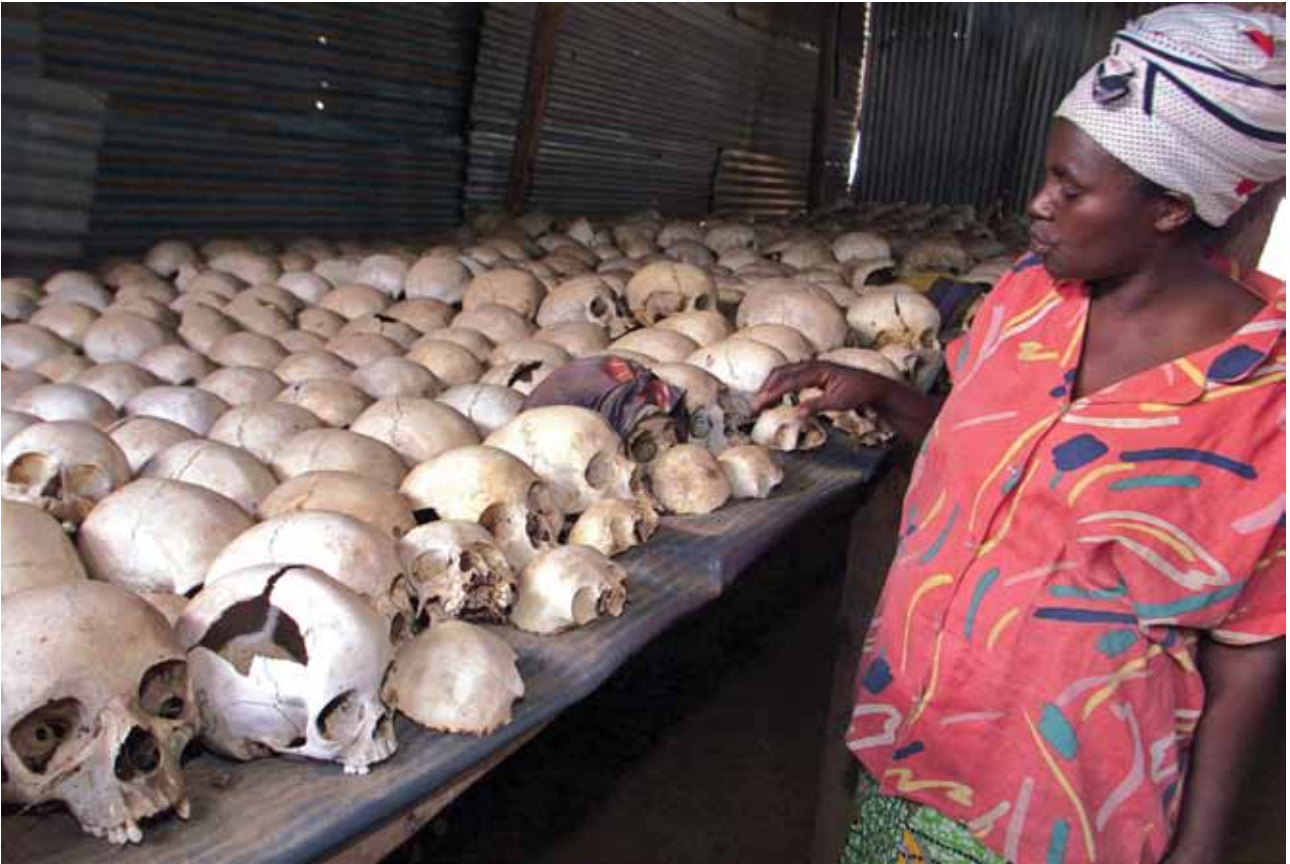
A Rwandan caretaker examines a display of human skulls, the remains of some of the 5 000 Tutsis massacred in the Ntarama Church compound in April 1994, during Rwanda's genocide (16 June 2002).

Hutu extremists activated the command to exterminate all Tutsi 'cockroaches' and moderate Hutu or Twa sympathisers. Within two weeks, 250 000 were dead by the hands of Interahamwe militia and civilians wielding machetes, spiked clubs and automatic rifles. 3 By May 1994, approximately 75% of the Tutsis in Rwanda had been killed. 4 Although genocidal ideology is simple in theory, such an alarming rate of slaughter shows that the execution of genocide demands efficient organisation, methodical implementation and incredible ambition on the part of the orchestrators. With the international community providing little real assistance through the United Nations Assistance Mission for Rwanda (UNAMIR), the RPF alone took Kigali and ended the genocide on 17 July 1994.