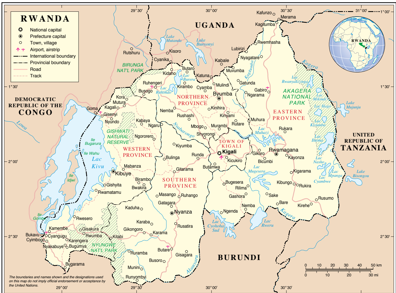
Map No. 3717 Rev. 10 UNITED NATIONS June 2008

Department of Field Support Cartographic Section