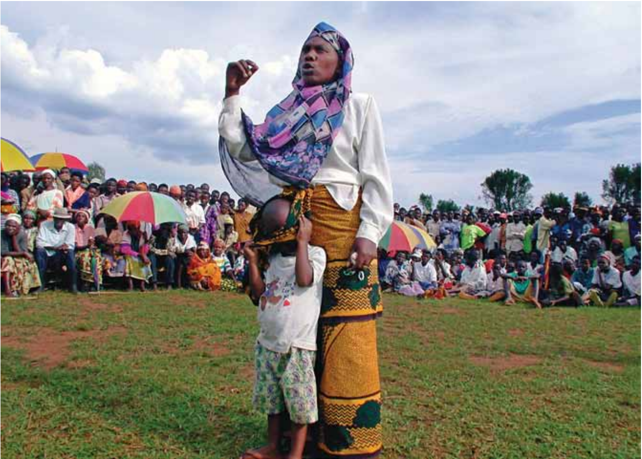
Many victims felt gacaca lacked guarantees of confidentiality and forced a woman to unearth secrets, such as that related to rape and sexual torture, that could result in her social isolation.

obligation under the 2001 Organic Law: “[N]obody having the right to get out of it for whatever reason.” 13 Seeking testimony from people recovering from mass atrocity risks converted the promise of victim participation into a duty to partake in further traumatising. The question of mandating public suffering is especially pertinent in cases of rape and sexual torture, of which 8 000 such cases were transferred to gacaca following a 2008 modification of the law. 14 Many victims felt gacaca lacked guarantees of confidentiality and forced a woman to unearth secrets that could trigger her social isolation. Minimal provisions were made to combat these fears, such as allowing a rape victim to submit written testimony and to disqualify judges.