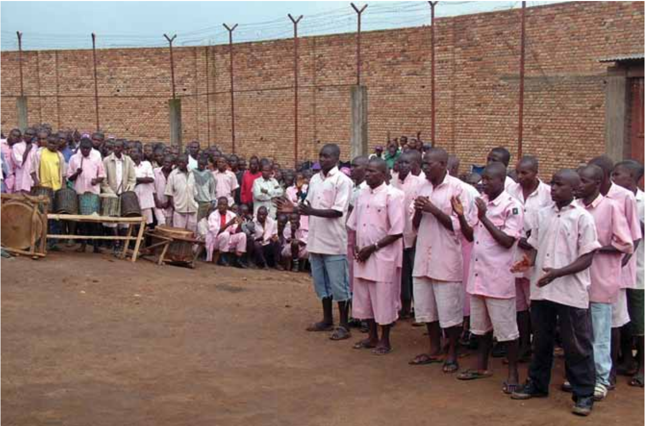
Genocide suspects confess their role in the 1994 killings to receive reduced sentences at Myove prison in Byumba village, Rwanda (8 February 2005).

of historic ideologies that had created an entire criminal population in the streets.