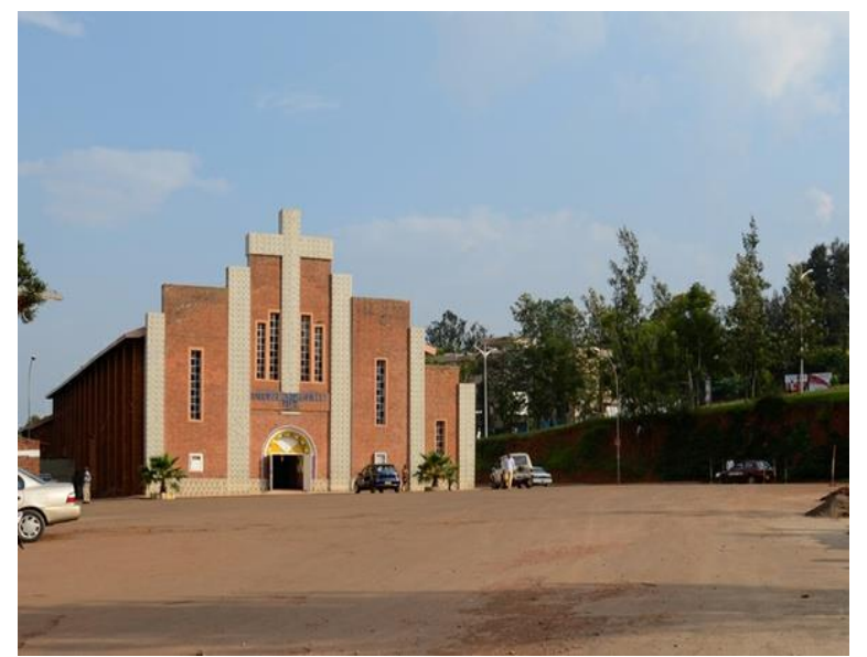
Sainte Famille church, Kigali, 2014

Radio stations urged them on, calling for the death of Tutsi "cockroaches".