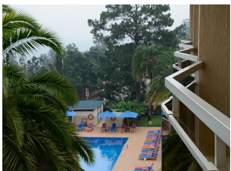
Hotel des Milles Collines, Kigali, 2014

The US, meanwhile, was determined to avoid putting boots on the ground. It was just six months after the humiliation of its forces in Somalia when 18 US rangers were killed in an incident which became known as Black Hawk Down.