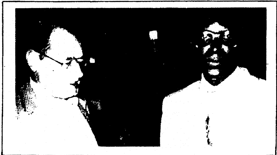
NGULINZIRA mu gihirahiro

2. - Ububasha bwa Perezida wa Repubulika na Guverinoma: