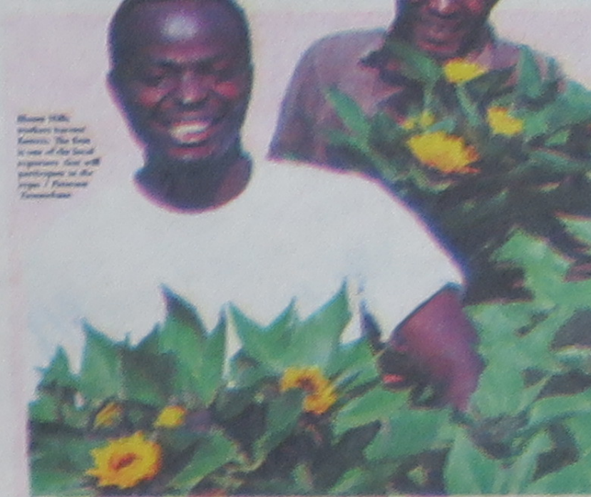
Local flower exporters for Amsterdam trade expo Rwanda will participate in the 7th International Horticulture and Floriculture Trade Fair (IFF) in Amsterdam, Netherlands. The week-long expo, that kicks off tomorrow, will attract over 500 exhibitors and 10,000 visitors, including farmers, exporters, investors and buyers from across the world. The country will be represented by more than 20 local companies that will try to position Rwanda as an emerging flower and horticulture producer. By PETERSON TUMWEKAZI Sun 11 Pg 15

PRICE: RWF 700, USHS 1,500, KSHS 100, FBU 1,400