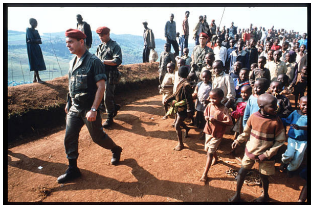
French troops arrive in Rwanda

In Paris, within hours the military headquarters announced three mass graves were found by the advancing commandos. But the discovery of the mass grave was mentioned in single sentences from the barrage of news stories which were concentrating on the troop deployment.