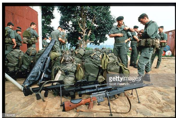
French troops check their gear at the airport June 24 1994 in Bukavu Zaire before departing to Nyarushishi